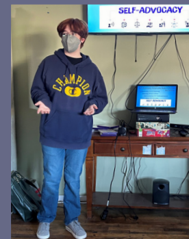
EXAMPLES OF THE ADVOCATE-TRAINERS IN ACTION